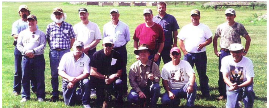
MCDONALD SPORTSMEN'S CLUB BPCR SILHOUETTE MATCH 8-2-08 MATCH & CLASS WINNERS