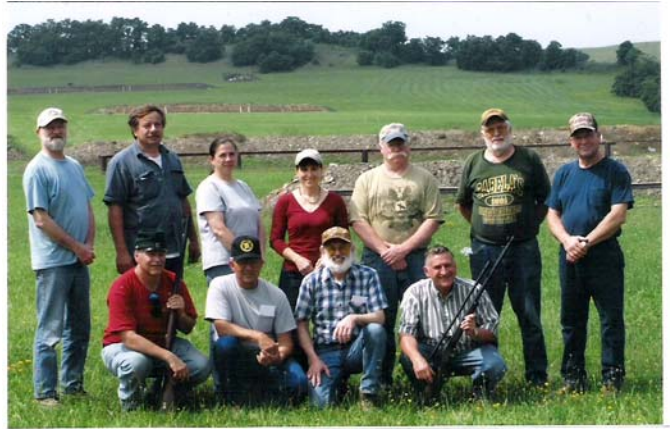
MCDONALD SPORTSMEN'S CLUB BPCR SILHOUETTE MATCH 7-5-08 MATCH & CLASS WINNERS